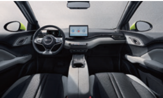
Black and grey